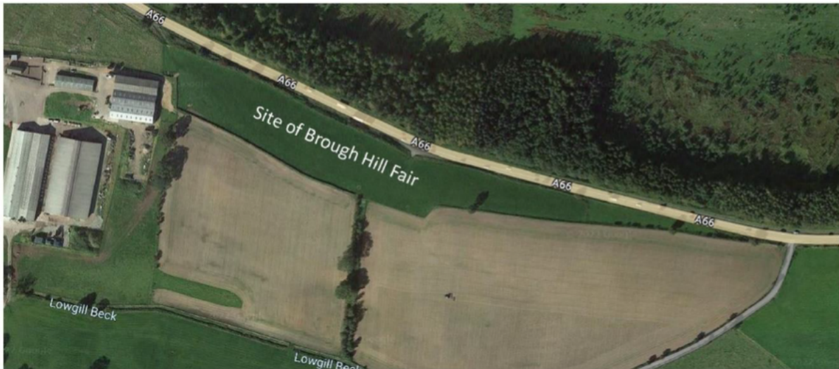
Site of Brough Hill Fair: Relevant land – Aerial view.

Plan of land at Warcop: 20843 square metres of agricultural land, hedgerow, trees and public right of way (372020), north of Low Gill Beck, Flitholme, Appleby-in Westmorland, CA16 6PR. The conveyance transferred ownership of land from an unknown party to the Secretary of State for Defence. The year is believed to be 1946 or 1947.